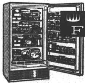
Model UFPD-12-62 11.78 cu. ft. net capacity

Thriftiest FRIGIDAIRE Frost-Proof Food Freezer!