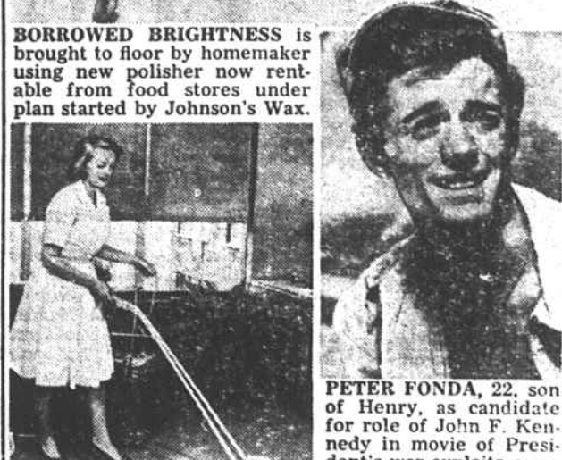
BORROWED BRIGHTNESS is brought to floor by homemaker using new polisher now rentable from food stores under plan started by Johnson's Wax.