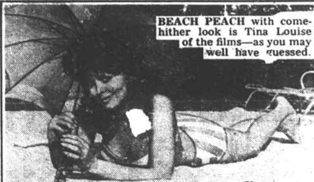
BEACH PEACH with comely look is Tina Louise of the film—as you may well have guessed.