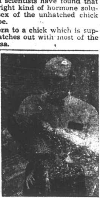
Dr. Gregory Pincus holds tray of eggs before dipping them into solution containing a female sex hormone which will "feminize" an embryonic rooster. He is a March of Dimes researcher.

If such birds are allowed to hatch and mature without any