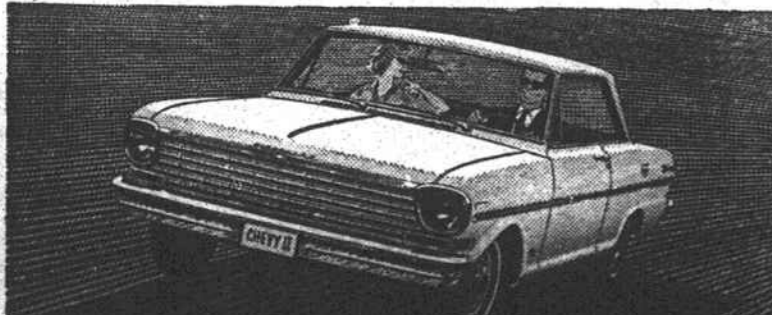
GO CHEVY II for '63-IT'S EXCITING!

of others have started to sag and sigh: new flush and dry rocker panels under the doors to guard against rusting... self-adjusting brakes... Delcotron generator for longer battery life.