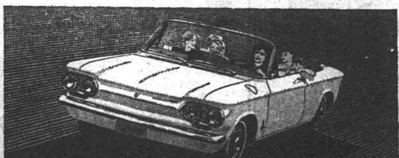
GO CORVAIR for '63-IT'S EXCITING!

Hard as it may be to believe, this year's Chevy II is better, better than last year's and better than anything in its class.