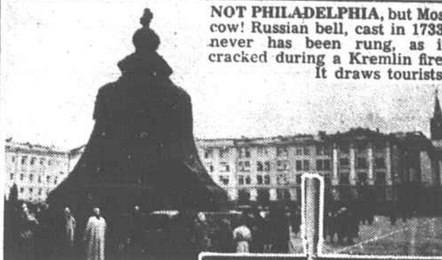
NOT PHILADELPHIA, but Moscow! Russian bell, cast in 1733, never has been rung, as it cracked during a Kremlin fire. It draws tourists.