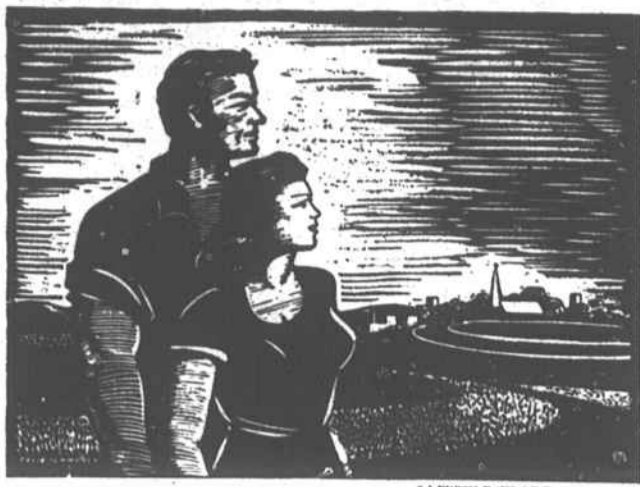
WE TURN OUR EYES TO THE FUTURE

"It is up to us, as good stewards, to develop the potential richness of our soil and water resources. Conserve them we must, but conserving them means using