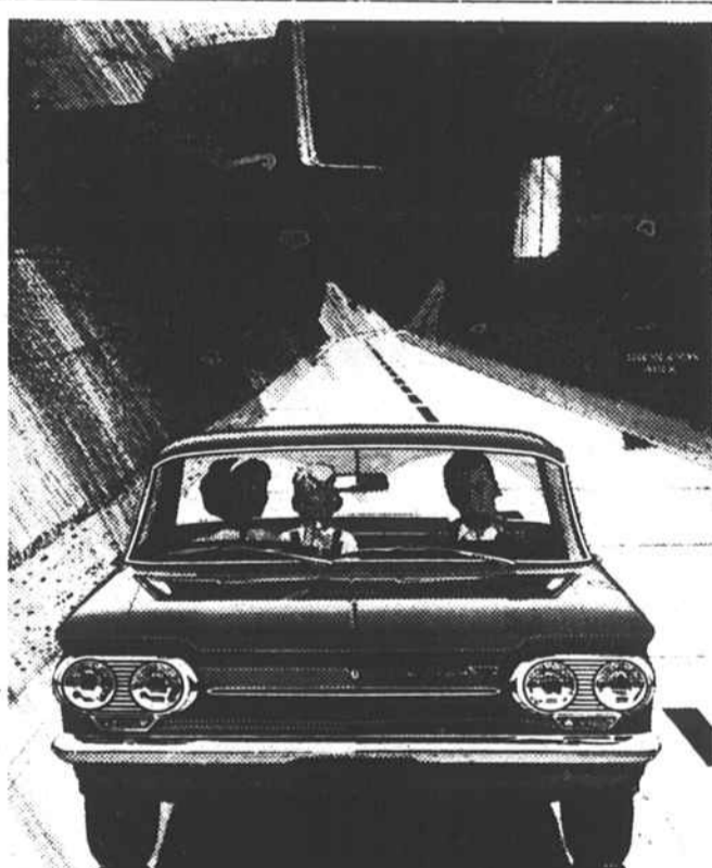
Monza Spyder Club Coupe