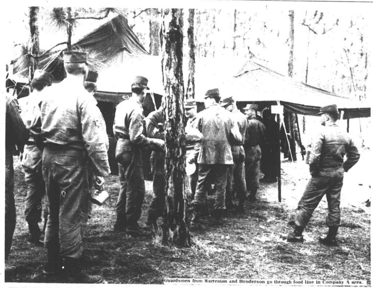
IN CAMP-National Guardsmen, including members of the Warrenton Company, are expected to retun to their home Sunday after two weeks of training. The scene