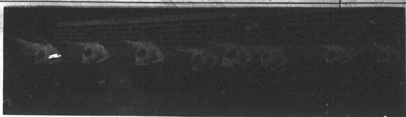
Warrenton's eight cheerleaders rehearse their job prior to tonight's gridiron clash between John Graham and Weldon. Cheerleaders will toss miniature footballs into the War-

The Jackets, after yielding a safety after a snap from center sailed over the head of