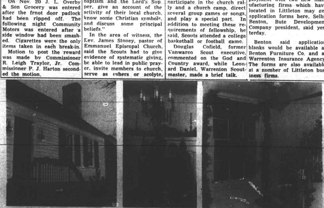
HOLIDAY HOUSE DISPLAYED BY WARRENTON GARDEN CLUB MEMBERS.