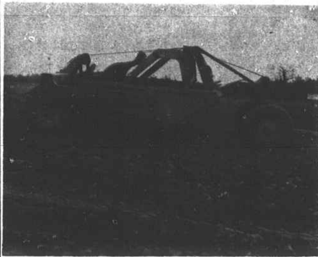
This scene was repeated many times in Warren County during 1963; heavy equipment moves valuable top soil from waterways, hedgerows, and field borders and deposits it on severely eroded areas.

The Soil Conservation Service technicians that have technical supervision of the land smoothing and the contractors have found it a pleas-