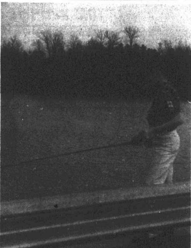
Across the road boy tries luck with rod and reel.