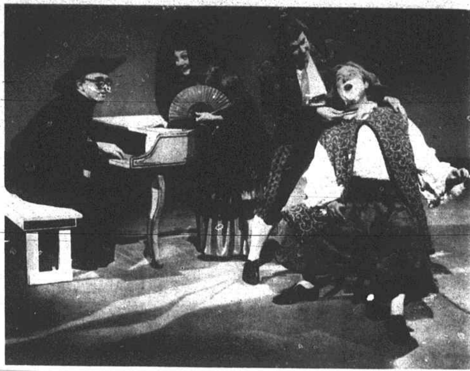
Bumbling old Doctor Bartolo almost gets his throat cut as the BARBER OF SEVILLE, Figaro, tries to divert the Doctor's attention from the romance between his ward, Rosina, and her suitor, the Count, who is disguised as a singing teacher. This scene is