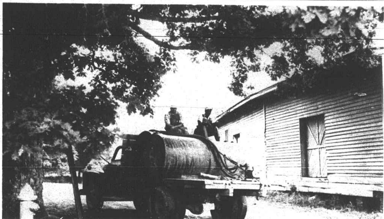
TOWN WATER FLOWS INTO TOBACCO FARMER'S TANK ON TRUCK