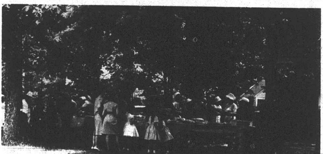
SCENES AT MACON CHURCH PICNIC