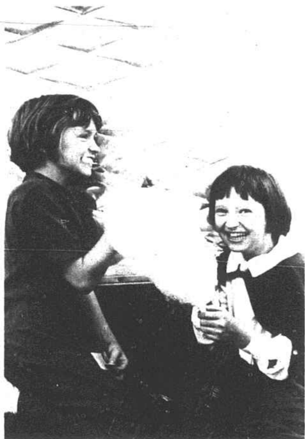
Children eat and ride during school children's day at Fair Wednesday afternoon.

The meeting will be held in the Inez Club House at 7:30 o'clock.