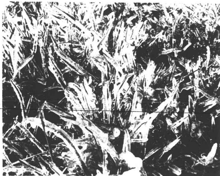
PROMISE OF WINTER -- Staff Photographer Bill Jones caught the wintry scene of early morning ice and frost Tuesday morning near Warrenton's pumping plant on Fishing Creek.