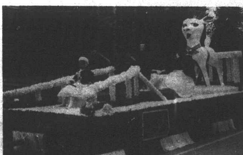
Children, floats and music bring joy as Warrenton holds its annual Christmas Parade here last Friday afternoon.