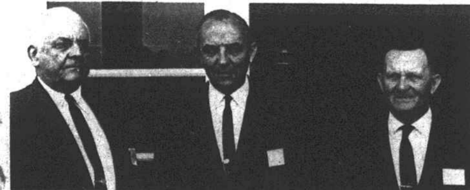
Warren County commissioners who participated in a one-day program at Murdoch Center in Butler which was designed to portray the role of county commissioners in the development of community action programs