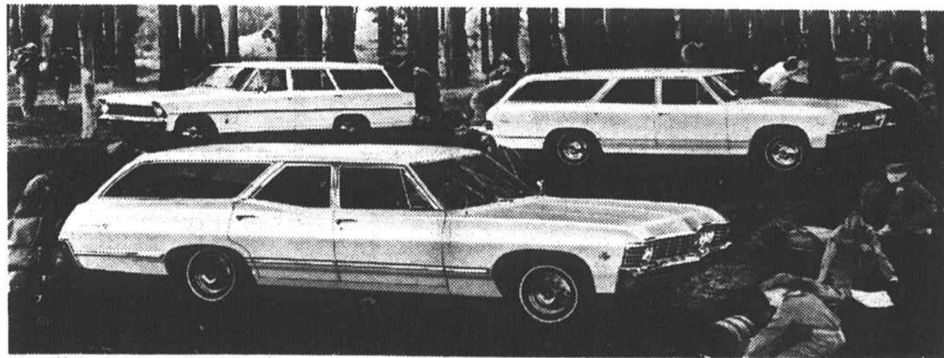
Top left: Chevy II Nova Station Wagon. Foreground: Chevrolet Impala Station Wagon. Top right: Chevelle Malibu Station Wagon.

When you look for the most room and the smoothest ride and the best value, you'll end up with a Chevrolet wagon everytime.