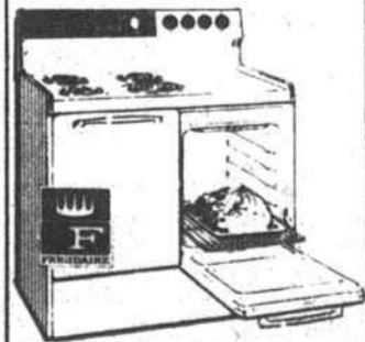
RSA-10K, 40" electric

Lowest priced FRIGIDAIRE 40" range you can buy!