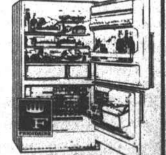
FFD-100AK, 10.9 cu. ft. (NEMA standard), 3 colors in white. Easily connected to water supply.

Say farewell to messy, drippy ice trays!