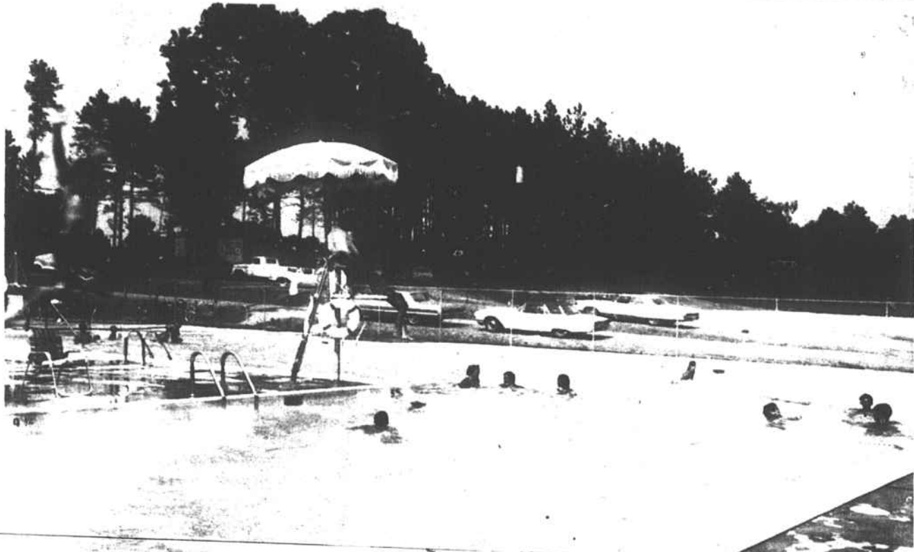
Work at the Warrenton Recreation Club is moving along well with the swimming pool completed, grading almost completed and with good progress being made on the club house. Members have enjoyed swimming for several weeks. At top is a picture of the swimming pool taken this week. At right is a picture of the clubhouse under construction.