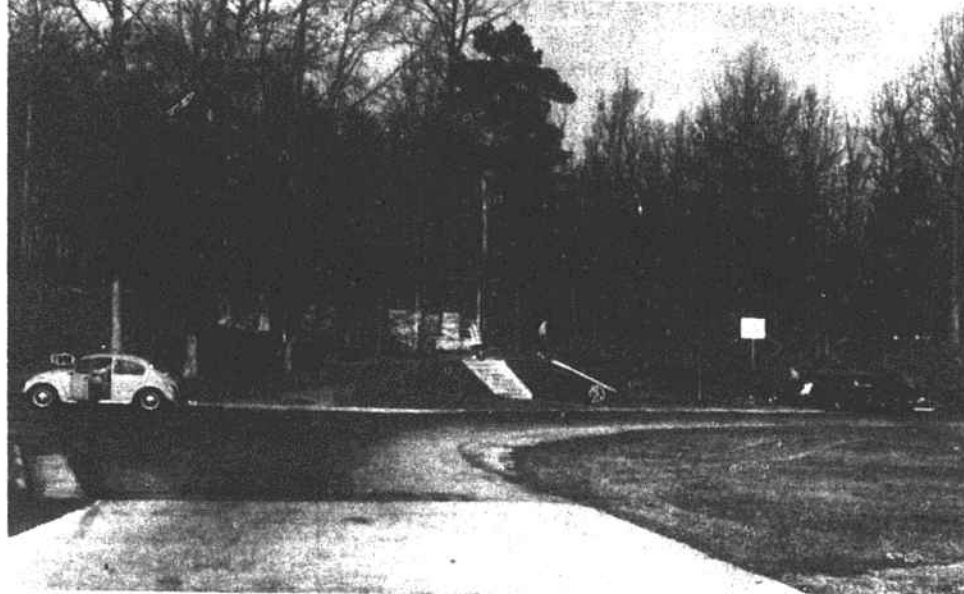
REST CENTER SITE OF WELCOME STATION