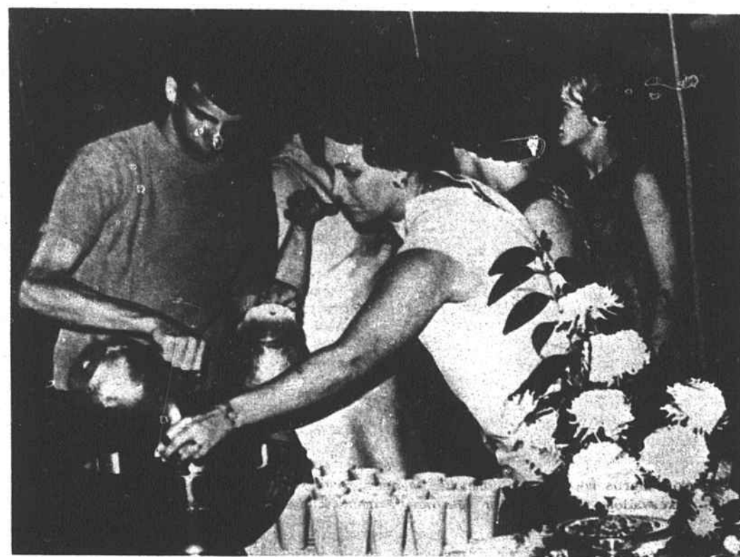
MIXING INGREDIENTS AT NORLINA PROM

The seniors were introduced at 8:15 beginning a truly memorable evening, under the theme, "The Impossible Dream!"