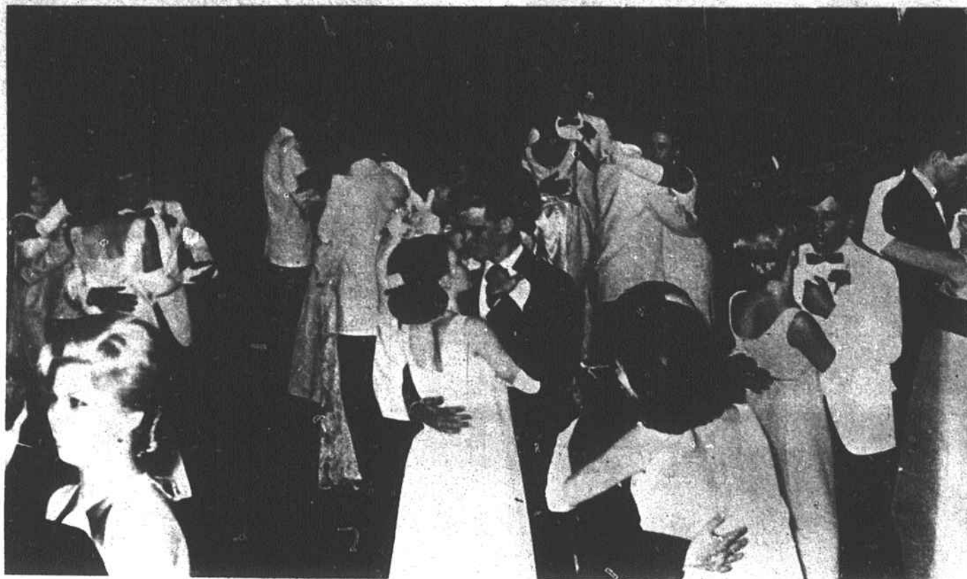
GUESTS FIND DANCING PLEASANT AT NORLINA PROM