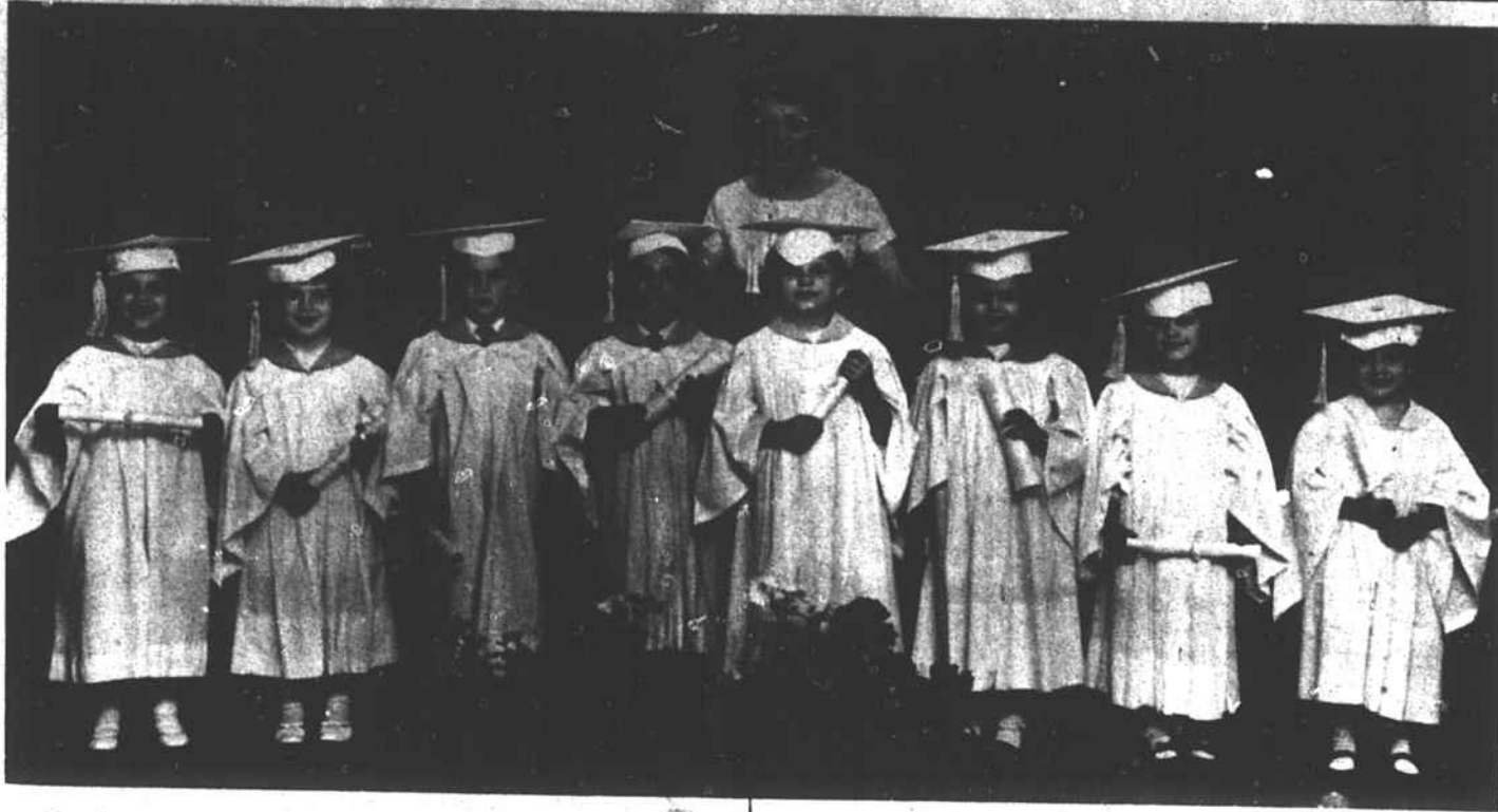
Members of the Harris Kindergarten graduation class are pictured during exercises held at the Sunday School room of Wesley Memorial Church on May 31. Shown with their teacher,