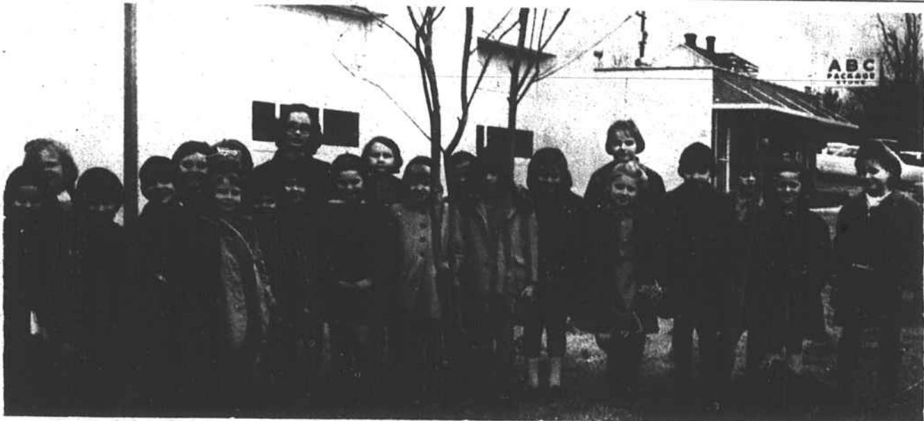
Scouts Aid In Tree Planting