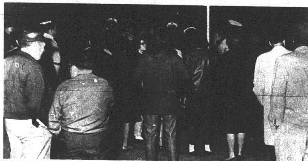
Ambulances of Warren County Rescue Squad are shown on Display at Thompson's Warehouse here on Saturday morning during auction sale. At left part of large crowd attending sale is shown.