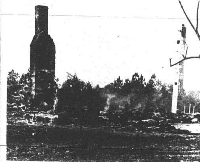
WHERE AGED WOMAN DIED

The body of an 87-year-old Negro woman was found in the ruins of a two-story frame house near Manson by firemen some two hours after the fire had been reported to members of the Drewry Volunteer Fire Department.