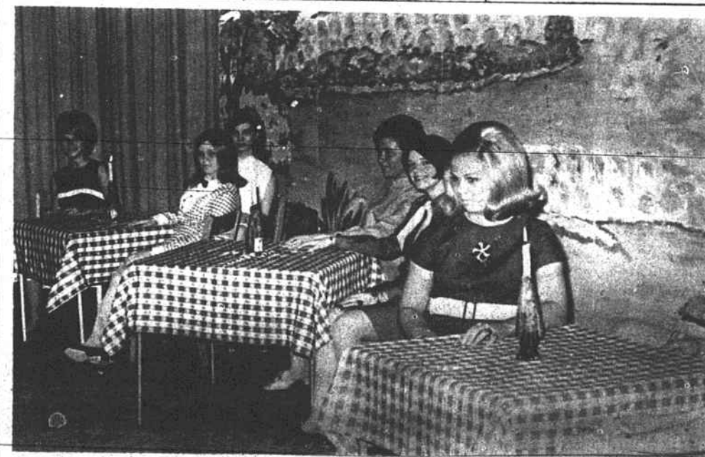
Shown above is the Mod Scene from last year's fashion show, sponsored by the Norlina Junior Woman's Club. The latest in mod fashion clothes will be shown again at the show on Friday night.