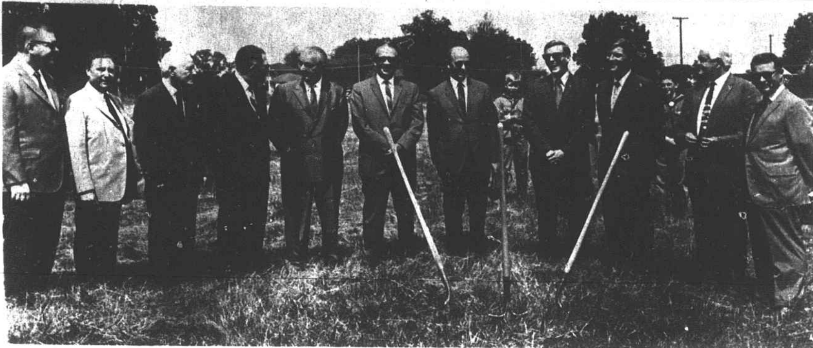
Dignitaries Pictured At Groundbreaking Exercises