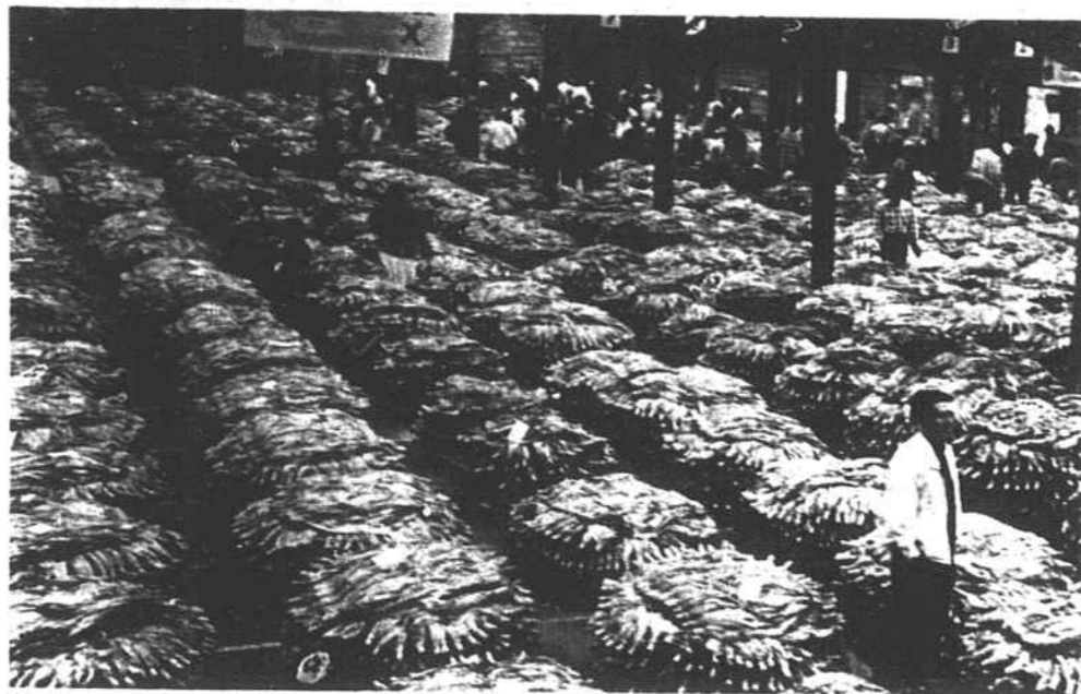
FAMILIAR SCENE AT MARKET OPENING

Warrenton District—Mariam Boyd, grades 1-3; South Warren, grades 4-5; Macon-grade 6; Hawkins-grades 7 and 8; John Graham - grades 9-12. Norlina District—Northside-grades 1-3; North Warren—