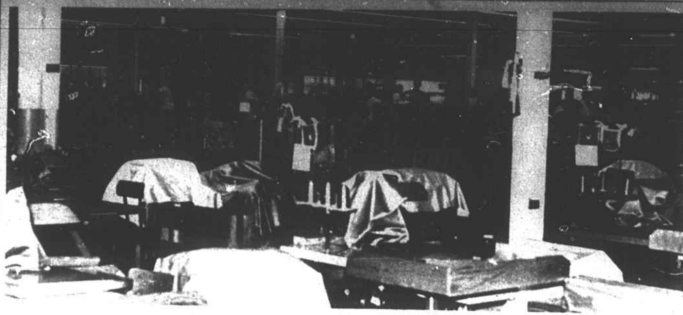
CROWDS ARE SHOWN TOURING SPORTSWEAR FACTORY