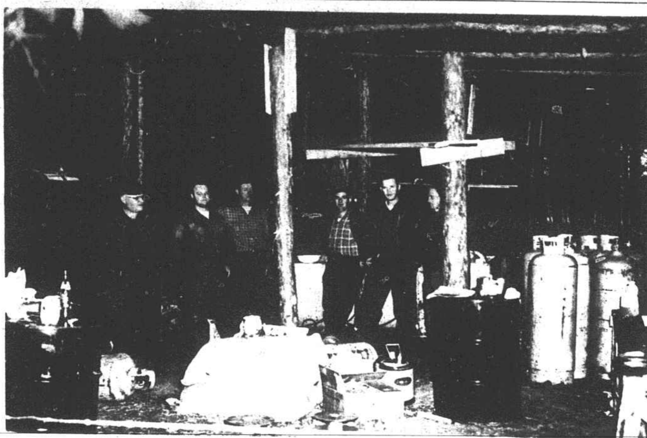
Officers At Still

cation is presumably from county funds. The largest single expense was $297.2 million for salaries of teachers, principals, and supervisors. The State paid the salaries for 42,703 classroom teachers, 1,992 principals, 157 superintendents and 111 assistant superintendents. The average salaries last term were: classroom teachers, $6,398; principals, $9,742; supervisors, $8,186; assistant superintendents, $10,949; and superintendents, $12,000. Other items in the audit, which are borne by the State include: Operation buildings, $14.7 million; transportation, libraries and health programs, $15.9 million; and operation of offices of superintendents, $5.2 million. In the report, Davis noted that the total school cost was 9.38 percent above the 1967-68 year—an increase of $28.7 million. Since the 1964-65 public school term, costs have increased $91.7 million.