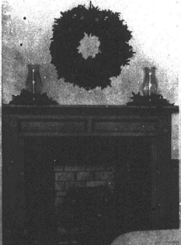
FIREPLACE AND MANTLE