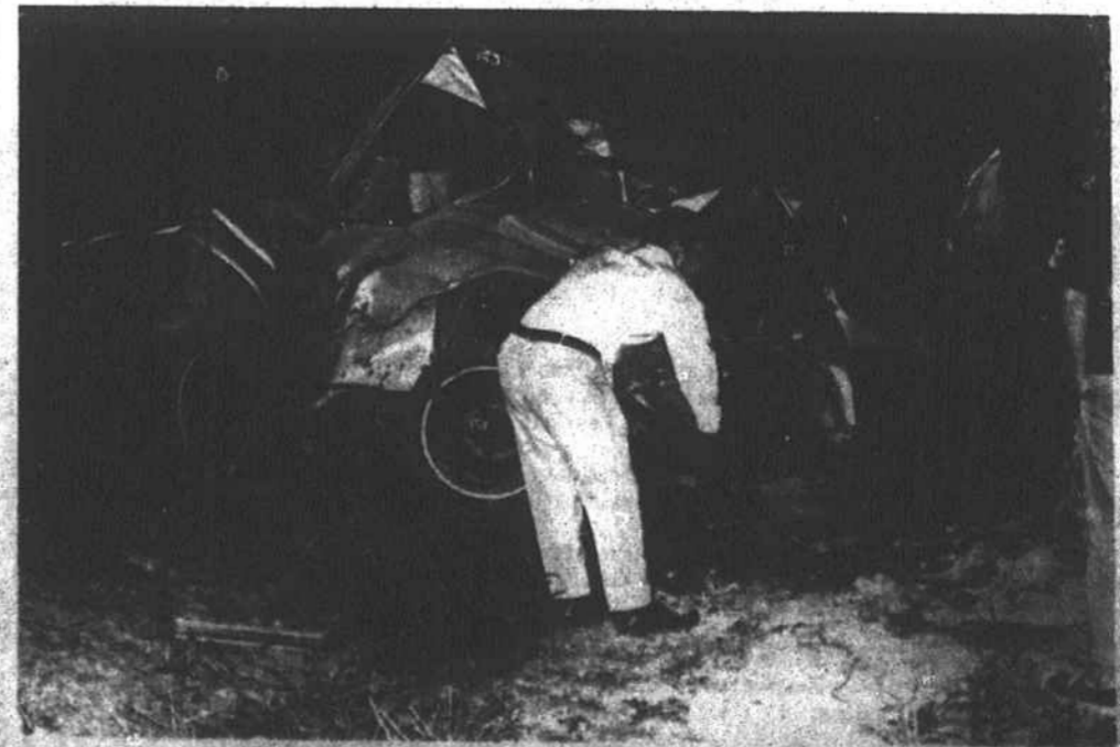
ANOTHER VIEW OF CAR FROM DIFFERENT ANGLE