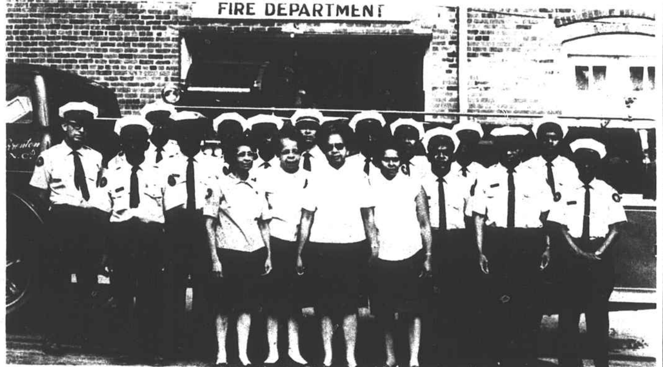
WARRENTON FIREMEN AND AUXILIARY MEMBERS