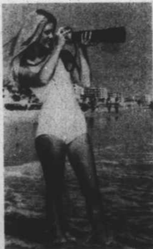
GOOD SHOT . . . Camera fan on Daytona Beach makes pretty picture as she turns telescopic lens toward the bright, blue waters. Easing of fuel shortage and sunny weather is attracting tourists to the Central Florida city's 23-mile stretch of white sand beach.

After a wedding trip to unannounced points, the newlyweds will be at home in Raleigh.