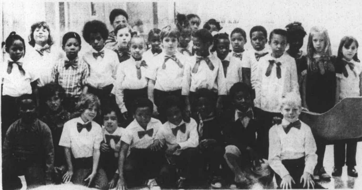
This group of second graders from Mariam Boyd School participated in a bicentennial program entitled "Salute to America" Friday. The program was seen by parents of Mariam Boyd students and the entire student body.

FINAL CLEARANCE on Washers & Dryers NOW at SEARS Warrenton, N.C.