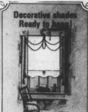
Delicate moiré pattern interpreted in snowy vinyl with a finishing touch of braid at hem and slit pocket. Available in carry-home widths to 37" (every inch). All shades 72" long. Patrician elegance, practical price.

But if you will be rolling the shade, glue cutouts near the bottom edge. Then leave this portion of the shade unrolled. Too much bending might crack the glue or damage your design.