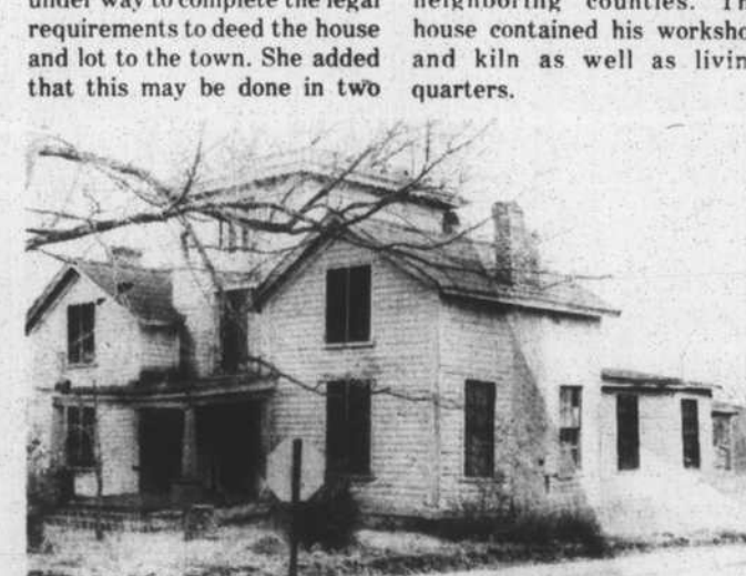
Views Of Jacob Holt House

Senator Speed has been assigned to Office No. 9 His telephone number is 829-5877.