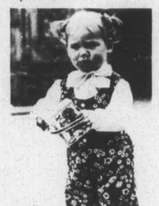
BABY WALE —For the prettiest girl in town, printed corduroy overalls with scoop neckline and button trim by Nannette.

With their naturally truculent attitude, it's little wonder that brown bears basically are loners. They may congregate when the fish are running, or during the mating season, but these gatherings are marked by frequent brawls.