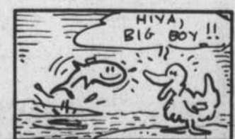
Sturgeon is the largest freshwater fish and can weigh 2,250 pounds.