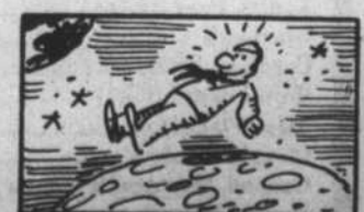
A person who weighs 160 pounds on earth would weigh only 30 pounds on the moon.