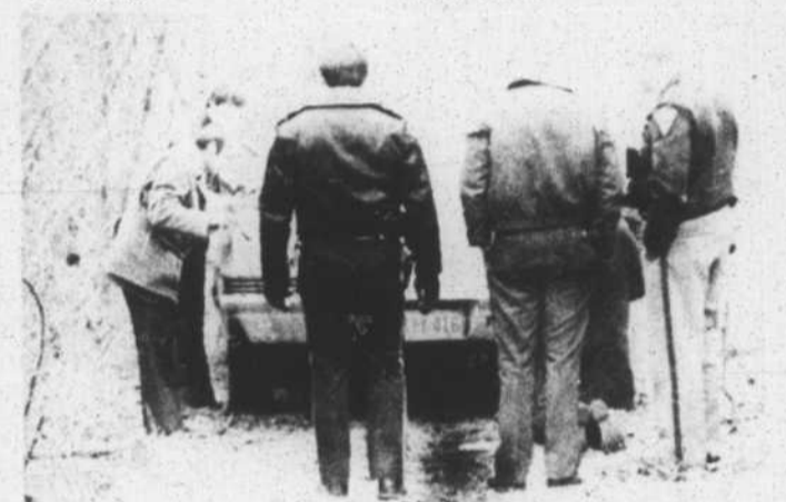
Officers Examine Missing Car

Darkness Tuesday halted the search of Lake Gaston by rescue squadmen and wildlife protectors who were hampered in their dragging operations by frigid water.