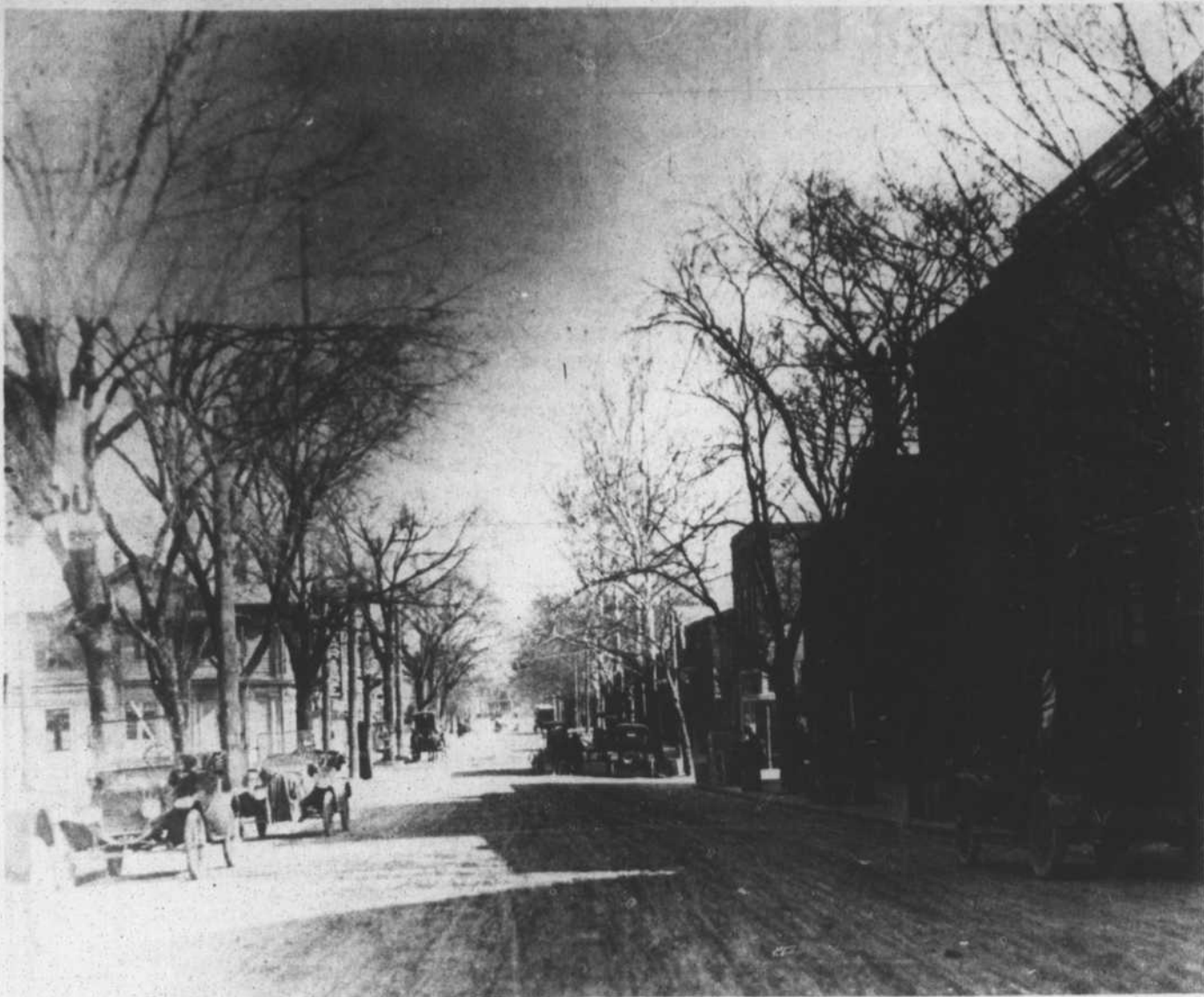
Parking hasn't always been a problem in Warrenton as this old picture, copied by the State Department of Archives and History, indicates. Looking north along Main Street, the