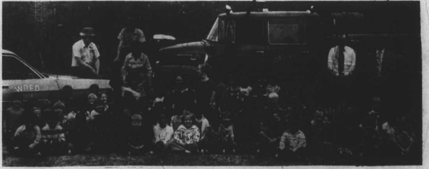
Northside Students Pose In Front Of Visiting Fire Trucks