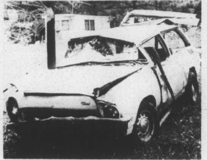
This is the car in which two Warren County young men were fatally injured Sunday night five miles southwest of Warrenton. The twin fatalities brought to 12 the number of road deaths in Warren this year.