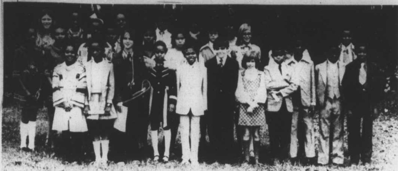
Members of North Warren Middle School's Student Council for the 1977-78 school year.