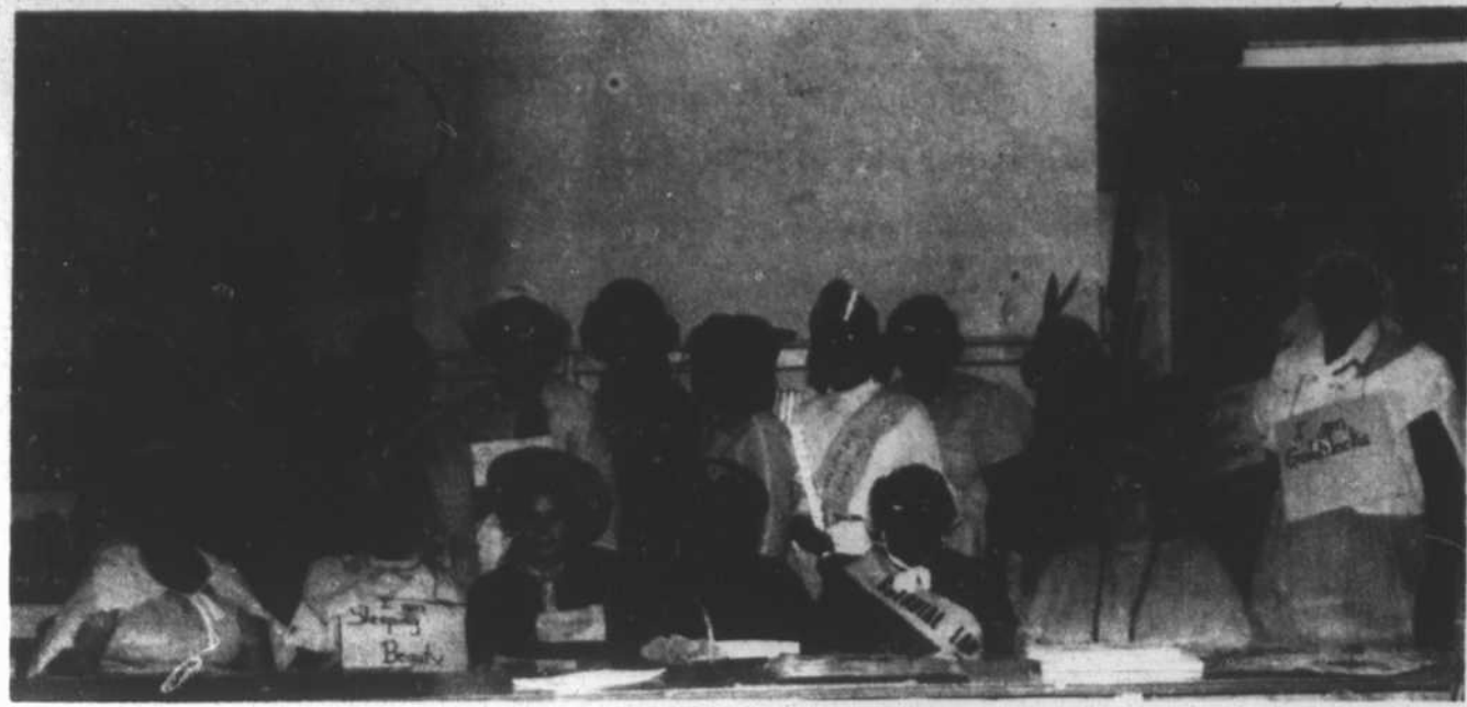
Teachers at South Warren School surprised their students last week by donning costumes of characters the students have met in their school work. Goldilocks, Sleeping Beauty and Harriet Tubman were just a few of the personages on hand during National Education Week.