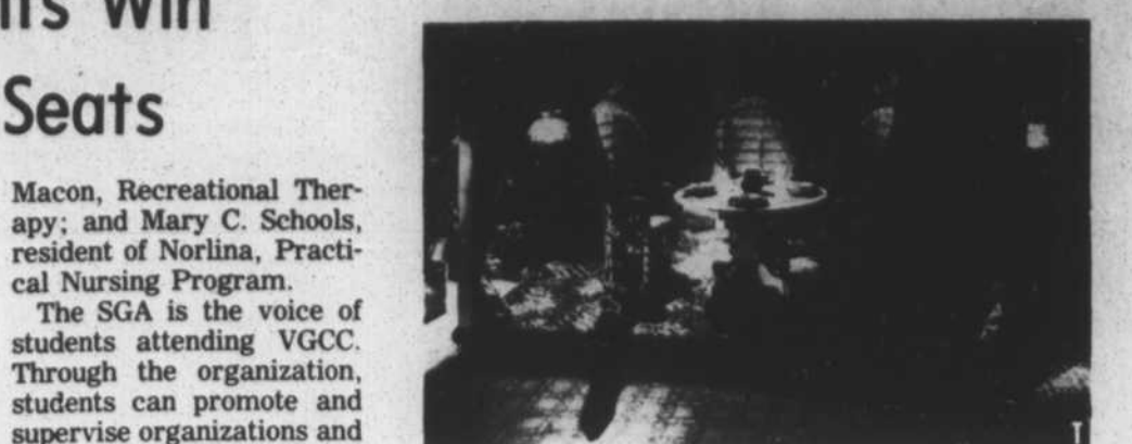
TODAY'S LIFE-STYLE calls for a home decorating style that's easy-care and casual.

Ideas for Christmas Stick Pins Gensuaus Lingerie Dold + Silver Belts Knit Date, Scarps, Gloves Rober Ditto Parts & Daps (Musses & Jrie) Jewelry Sweaters Galare Hower Pins a Combi Bago (Evening & Daytime) Dresses (Misses 4 (pis) Shawler Pantouto 4 Jumpouito Long Dresses Meles Mall Doutique Huduson Mall Hinduson, N.C.