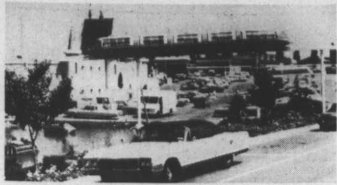
FUN PLACE... Dutch Wonderland theme park is located on Route 30, Lancaster County, Pa., on 44 beautifully landscaped acres in the heart of Pennsylvania Dutch Country.