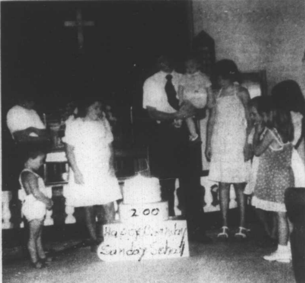
Pastor And Children At Sunday School Birthday