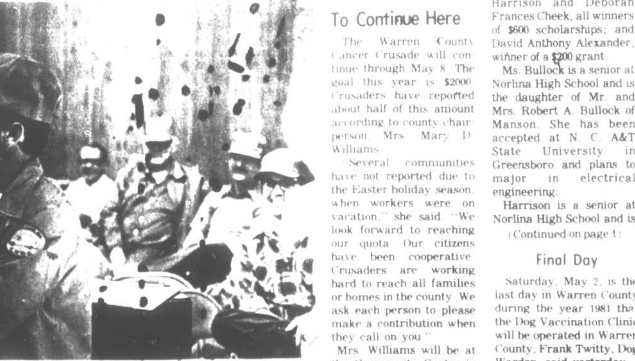
Warrenton Rural, Afton-Elberon, Arcola, Macon and the newly formed Churchill-Five Forks Fire Departments. The 27-hour course covered instruction on the proper use of ladders, hose and nozzle maintenance, pumping procedures, ventilation and forcible entry.